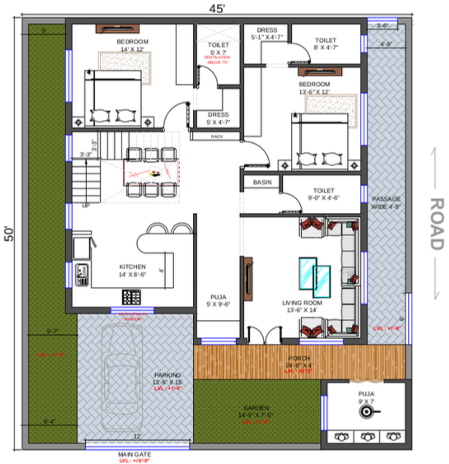
ROAD GROUND FLOOR PLAN